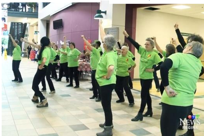
On with the show, this was it!