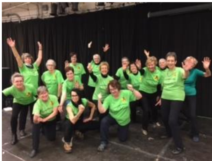
Final practice in the Multi-purpose Room