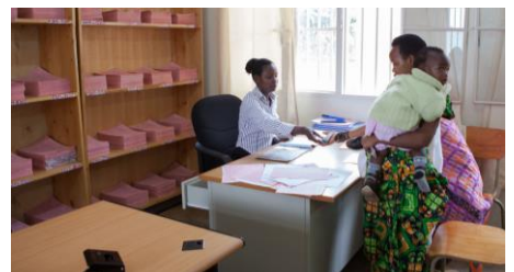
taken at Rwanda Women Network's Village of Hope Centre, 2014